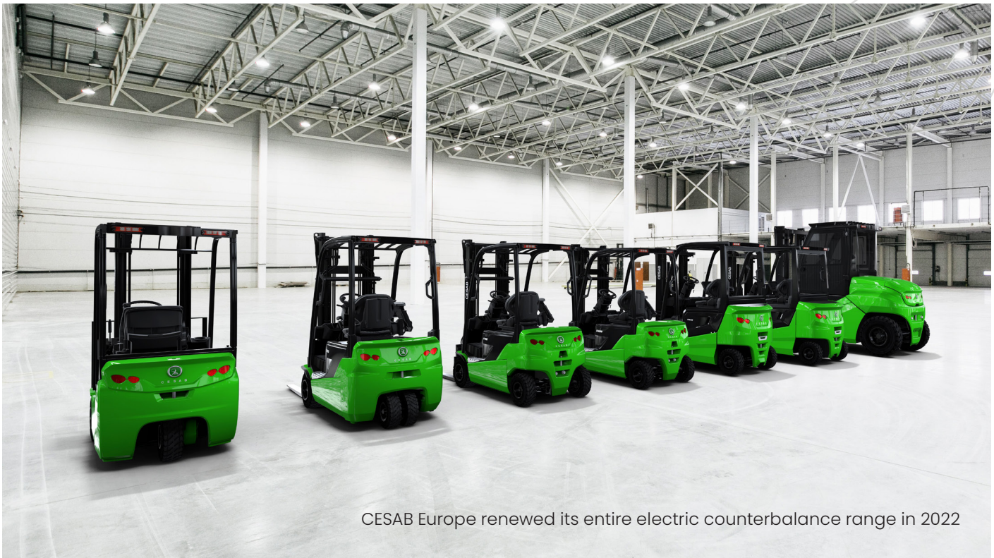
CESAB Europe renewed its entire electric counterbalance range in 2022