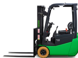
B213 1,25t @ LC 500