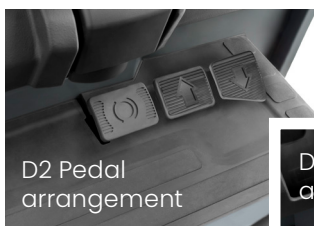
D2 Pedal arrangement

We believe that these CESAB trucks are not only the best 48V electric forklifts on the market, but also the most adaptable. Our multiple options meet the needs of most applications.