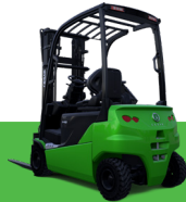
CESAB B400 48V-4-Wheel