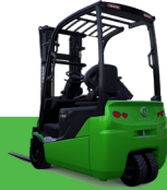
CESAB B300 48V-3-Wheel