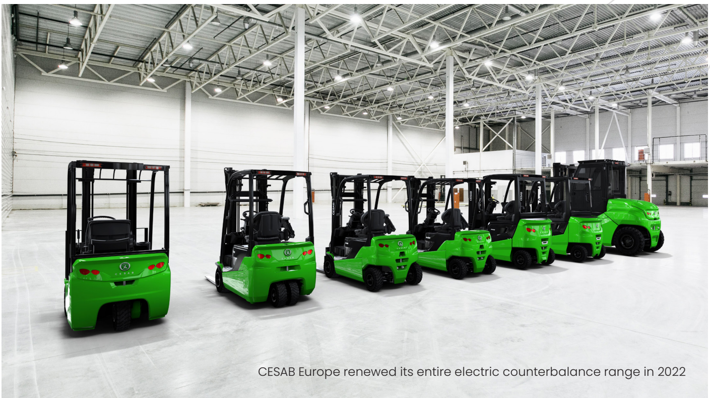
CESAB Europe renewed its entire electric counterbalance range in 2022