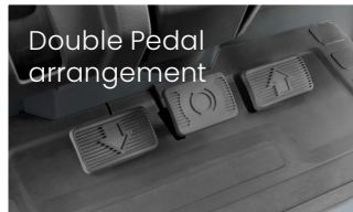
Double Pedal arrangement